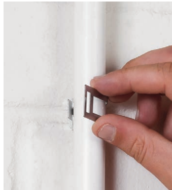
Simply wrap around the conduit, perfect for tight spaces