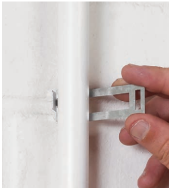
Provides a 3mm stand off from the surface