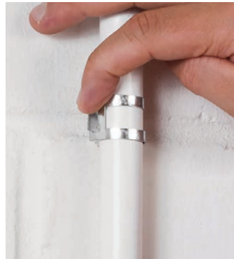
Secure conduit with locking tab