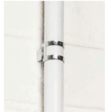
Centralised base fixing, gives a neat appearance to installation

Safe-D Conduit Saddles combine fire performance, quickest fix, and a modern look, to secure cables in 20mm & 25mm outer diameter PVC and galvanised conduit installations... & 20mm or 25mm o/d cables and pipes.